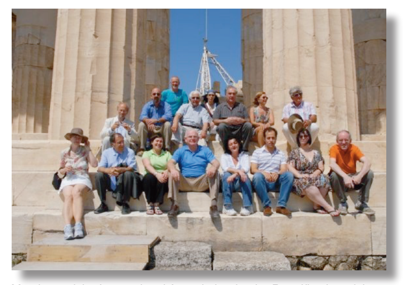
Members of the International Association for the Reunification of the Parthenon Sculptures at the conclusion of their tour of the Parthenon.